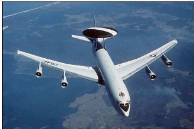
One of the most visible elements of C4ISR is the venerable E-3 Sentry Airborne Warning and Control System (AWACS) aircraft.

Centralized control and decentralized execution are fundamental tenets of US aerospace power. US Air Force C4ISR systems are designed to support these tenets. Proliferation prevention, counterforce, active defense, and passive defense requirements must be addressed throughout the overall aerospace C4ISR system. The C4ISR requirements for counter NBC operations will vary depending upon the type of operation, the nature of the threat, and the set of capabilities applied to counter the threat. Counter NBC operations