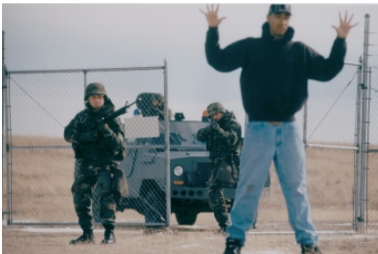
Active force protection includes measures to deal with the NBC terrorist threat.

Counter NBC terrorism is intertwined with the four major components of counter NBC operations. Awareness of the NBC terrorism threat will focus proliferation prevention efforts, highlighting attempts to acquire or use NBC weapons. Proliferation prevention should make it more difficult for these groups to access NBC weapons. Counterforce operations may remove an identified SOF or terrorist NBC threat before it can be used. Active defense capabilities should be able to defeat incoming NBC threats, and active force protection should include measures to deal