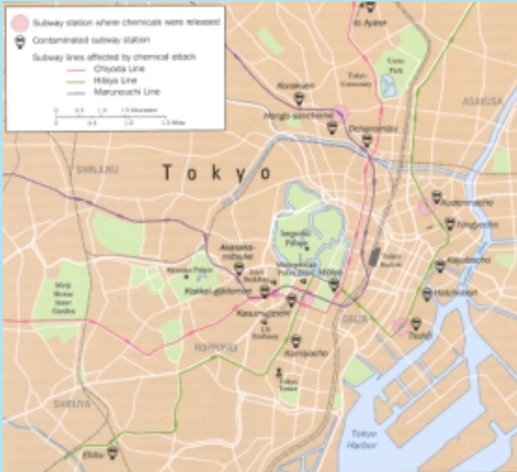
Tokyo subway system targeted by Aum Shinrikyo.

Acupuncturist Chuizuo Matsumoto, better known as Shoko Asahara, founded the group Aum Shinrikyo, or Aum Supreme Truth, in the early 1980s. Licensed in Japan as a religious organization in 1989, Aum was one of thousands of similarly registered groups, many of which claimed to offer spiritual refuge for Japanese alienated by the country's materialism. Aum promoted a version of Tibetan-style mysticism and promised extrasensory experiences as a path to enlightenment.