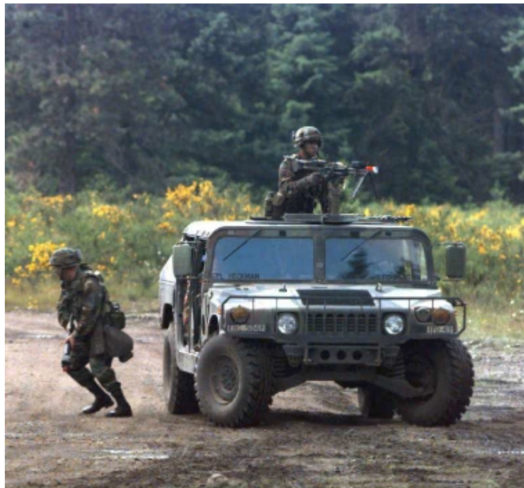
Active force protection is part of counter NBC active defense.

Active defense capabilities assist proliferation prevention through deterrence or by forcing adversaries to expend more resources on alternate delivery means. Successful active defense operations complement counterforce operations by forcing an adversary to alter their attack strategy, increase attack magnitude, and expose more of their NBC assets, making them more vulnerable to counterforce operations. Active defense operations further thin the threat, reducing the challenges to passive defenses, increasing the ability of friendly forces to survive to operate.