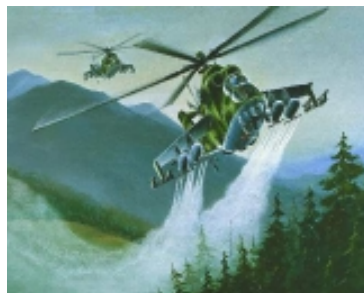
NBC weapons can be delivered by a variety of means to include helicopters equipped with sprayers that spread aerosol over a wide area.

Delivery means for NBC weapons can vary widely. Aircraft and artillery have been capable of delivering NBC weapons for decades. Newer delivery platforms include ballistic or cruise missiles, which pose complex challenges to aerospace forces. Clandestine delivery means are limited only by the imagination, but can include personnel, ground vehicles, watercraft, unmanned aerial vehicles (UAVs), or infected humans or animals.