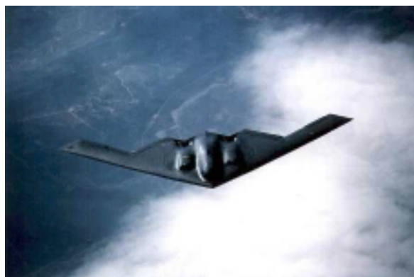
Stealth, precision, and long-range aircraft such as this B-2, provide planners for counter NBC operations with viable options to produce success.

Time-sensitive Targets (TSTs) are those which require immediate response before they pose (or soon will pose) a clear and present danger to friendly forces or those which are highly lucrative, fleeting targets of opportunity. These may have an extremely limited window of vulnerability or opportunity, the attack of which is critical to ensure successful completion of the