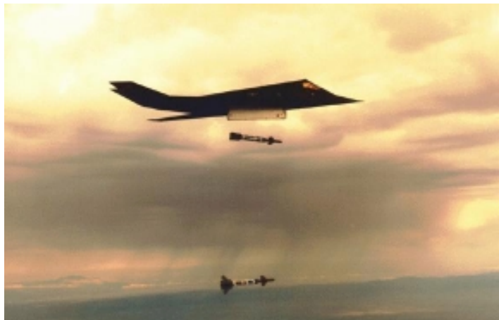
Stealth and precision enhance counter NBC operations.

Counter NBC operations should be integrated into normal command relationships in peace or war. Aerospace forces may operate under a JFC who exercises combatant command or operational control over the joint force. The joint force C2 support system gives the JFC the means to exercise that authority and direct assigned and attached forces to accomplish the mission. The JFC will determine the priority for NBC operations in the overall campaign plan. The JFC has the authority to appoint a joint force air component commander (JFACC) to direct aerospace operations. The JFACC integrates counter