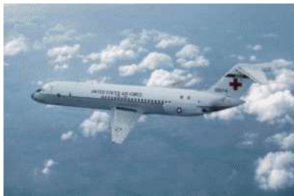
One use for the C-9 NIGHTINGALE is aeromedical evacuation.

Aeromedical evacuation (AE) of casualties will be challenging under NBC conditions. Potentially contaminated patients must be decontaminated before entering the AE system unless the theater and US Transportation Command (USTRANSCOM) CINCs direct otherwise. Decontamination and processing procedures must be in place to prevent spreading the NBC agent and assure the appropriate protection for patients, aircrew, and aircraft. Medical decontamination teams identify and neutralize contaminants and perform early diagnoses to protect AE crewmembers and other patients. Once patients are externally decontaminated, further AE decisions are based upon