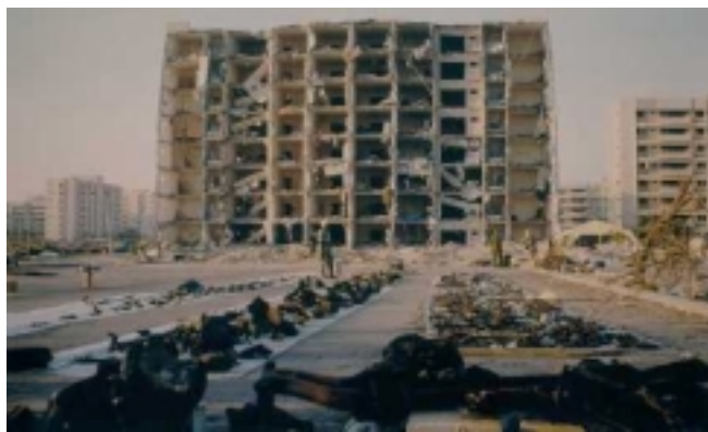
The terrorist attack on Khobar Towers demonstrates the risk to deployed US forces from clandestine operations.

Not all NBC agents have the same impact on operations. Agents have different degrees of lethality and persistence. Different delivery means create different concentrations and areas of contamination. Finally the impacts from adversary use of nuclear, biological, and chemical capabilities vary significantly across the spectrum of conflict from peace to war termination. Commanders may choose to increase or reduce the level of protective posture based on mission operations tempo and the exact nature of the threat faced at the time.