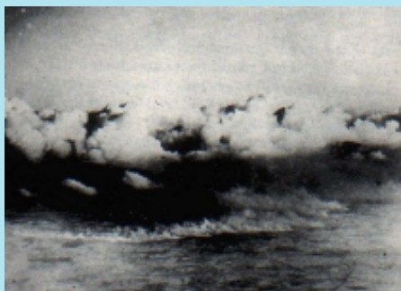
German chlorine gas clouds supposedly at Ypres on 22 April 1915.

The concept of creating a toxic gas cloud from chemical cylinders was credited to Fritz Haber of the Kaiser Wilhelm Physical Institute of Berlin in late 1914. Owing to a shortage of artillery shells, Haber thought a chemical gas cloud would negate the enemy's earthworks without the use of high explosives. In addition, gas released directly from its storage cylinder would cover a far broader area than that dispersed from artillery shells. Haber selected chlorine for the gas since it was abundant in the German dye industry and would have no prolonged influence over the terrain.