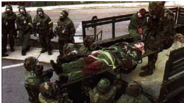
Medical personnel may need to work in protective equipment in a passive defense NBC environment.

NBC weapons present unique medical challenges, which affect activities ranging from active medical surveillance, aerospace medicine, preventive medicine, and clinical analysis, to risk management. Aerospace medical support assists commanders in identifying possible NBC threats and being prepared to mobilize, deploy, and provide quality medical support and health care to aerospace personnel, to allow sustainment of operations.