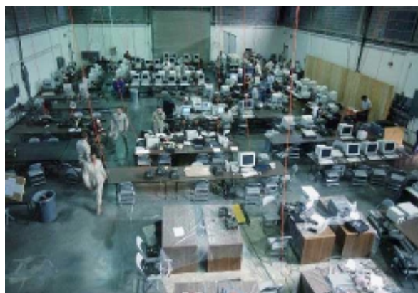
The air operations center is where counter NBC operations are integrated into the joint air operations plan (JAOP).

The release of NBC agents may be a direct result of proliferation prevention denial operations, counterforce operations, or active defense operations. Civilians, allied and US military personnel can be affected. As a result, all strikes against NBC targets need to be carefully planned and coordinated.