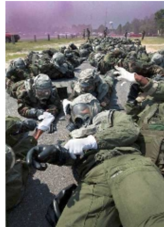
The type of agent or agents used will determine the level of protective posture.

The joint task force (JTF) or installation commander may choose to increase or reduce the level of protective posture based upon mission requirements and the exact nature of a threat. Certain threats are more persistent or may have multiple hazards such as Mustard Agent, but others may only be dangerous if inhaled. Therefore, the hazards may require different types or levels of protection. For example, if the nature of the threat is respiratory, only the protective mask may be required and the added encumbrance of full protective equipment can be avoided. Therefore, the commander can optimize the performance of his forces and balance the personnel protection level used based upon the proper identification of the threat agents available, the specific hazard of the agents, the amount of the threat agent available, and the threat means of agent weaponization.