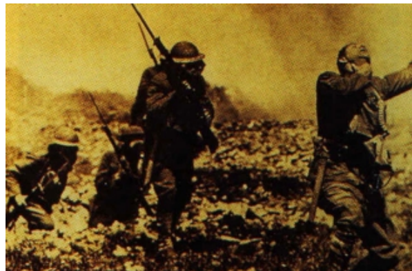
This posed instructional picture from World War I graphically portrays the need for proper training and practice.