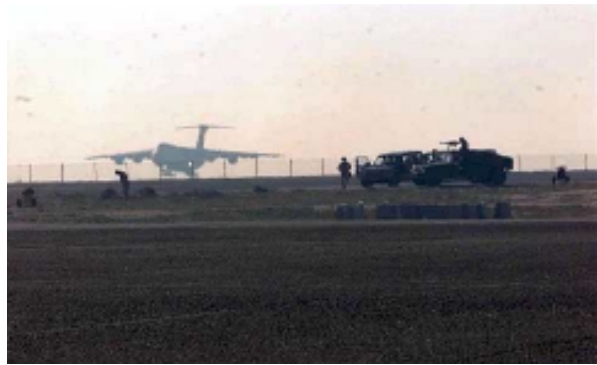
Airlift is vital to supporting deployed forces particularly in an NBC environment.

forces on the logistics system and personnel in the theater. Enemy NBC operations hold the promise of exceptional disruption to US wartime objectives if such NBC operations can be successfully executed. Deliberate planning and implementation processes must be employed to ensure that: the flow of critical mission essential consumables proceeds in a timely manner; the exposure of required materiel to NBC environments is minimized; logistics personnel are appropriately trained and equipped for NBC environments; the support system retains its agility while minimizing its footprint in the targetable area; and support operations are coordinated with counterforce, active defense, and passive defense measures, as required.