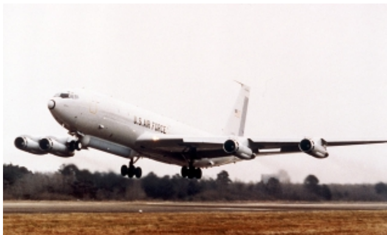
JSTARS, AWACS, and satellites may need augmentation by specialized detectors due to the unique nature of some NBC targets.

In terms of proliferation prevention, ISR monitors the development of NBC weapons allowing the international community to take steps preventing the further development and deployment of NBC. ISR is also a critical supporting component of counterforce. A commander must have accurate ISR data to determine the target types, characteristics, proximity to population centers, and defenses. For active defense, ISR systems play a vital role in detecting, tracking, and warning of air and missile attacks, and may help identify NBC missiles. Additionally, ISR should provide commanders with an assessment of conventional and unconventional capabilities used against friendly personnel. For units within US territory, domestic law enforcement and other agencies that track ongoing criminal activity will probably provide this information. Finally, ISR supports passive defense by providing information on the threat, NBC agent detection, tracking warning, and other information vital to a commander's ability to protect friendly forces.